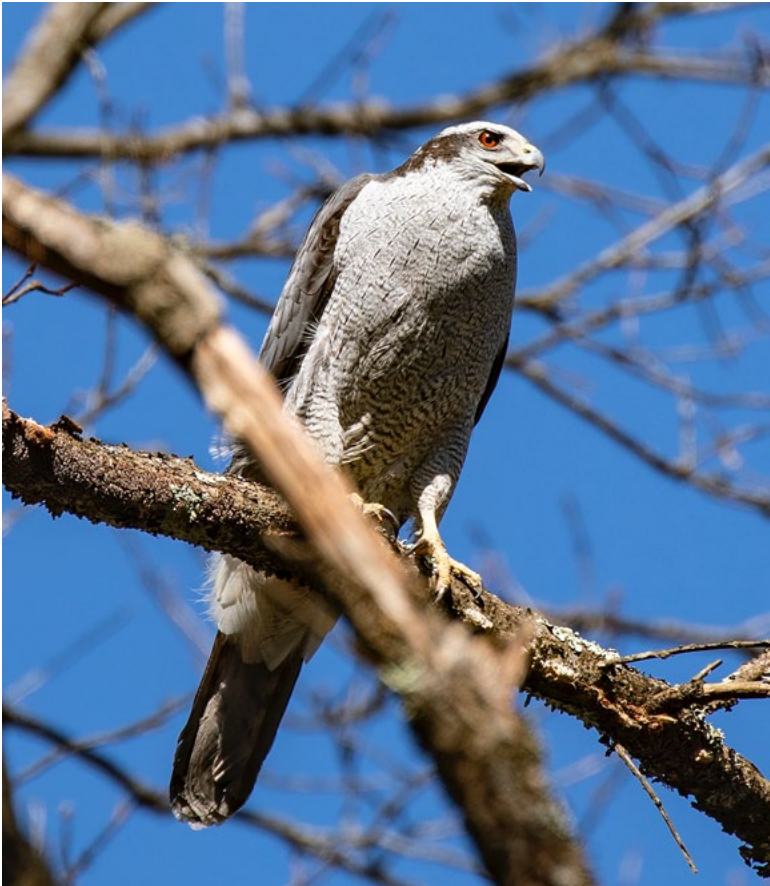
NORTHERN GOSHAWK BY NEIL DOWLING