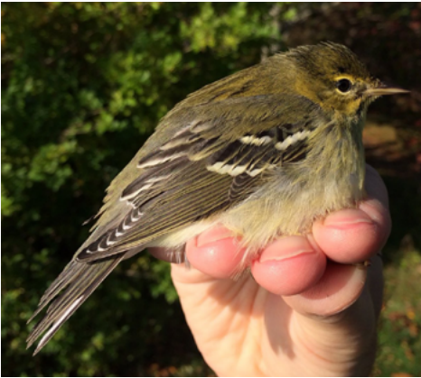
Figure 2. A Fatpoll! This Blackpoll Warbler was banded (#2160–46794) on September 20, 1999 weighing 11.5g. It was last recaptured weighing 17.3g on October 6, 1999 with a banding comment, “feels pudgy!”

The wet weather in September dampened migration, with observers at Manomet reporting conditions along the South Shore to be about as bad as they could be. The migration did, however, pick up during the last days of September and continued through October, during which strong winds from the south redirected migrants to the northeast. This phenomenon of reverse migration was especially notable on Cape Cod with many reports of vireo and warbler species that would normally have been long gone from our region.