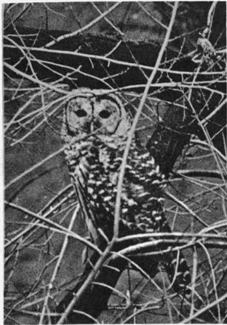
Barred Owl photographed at M.I.T.

In recent years, however, the widespread development of the Everglades region for agricultural uses, flood control, grazing, and residential and recreational projects has drastically altered and reduced the original habitat. The flow of water from Lake Okeechobee to the Everglades has been reduced by drought and diversion to agricultural areas. Add to this the threat of hurricanes, fire, shooting, increased pollution from pesticides used in the area, and the potential fate of the 100 or so remaining birds is all too apparent.