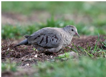
Common Ground Dove. 2015.

Best sighting: Ash-throated Flycatcher , Wellesley, November 11–12. This was the third record for 1980, before which there had been only three records for the state. 🐦