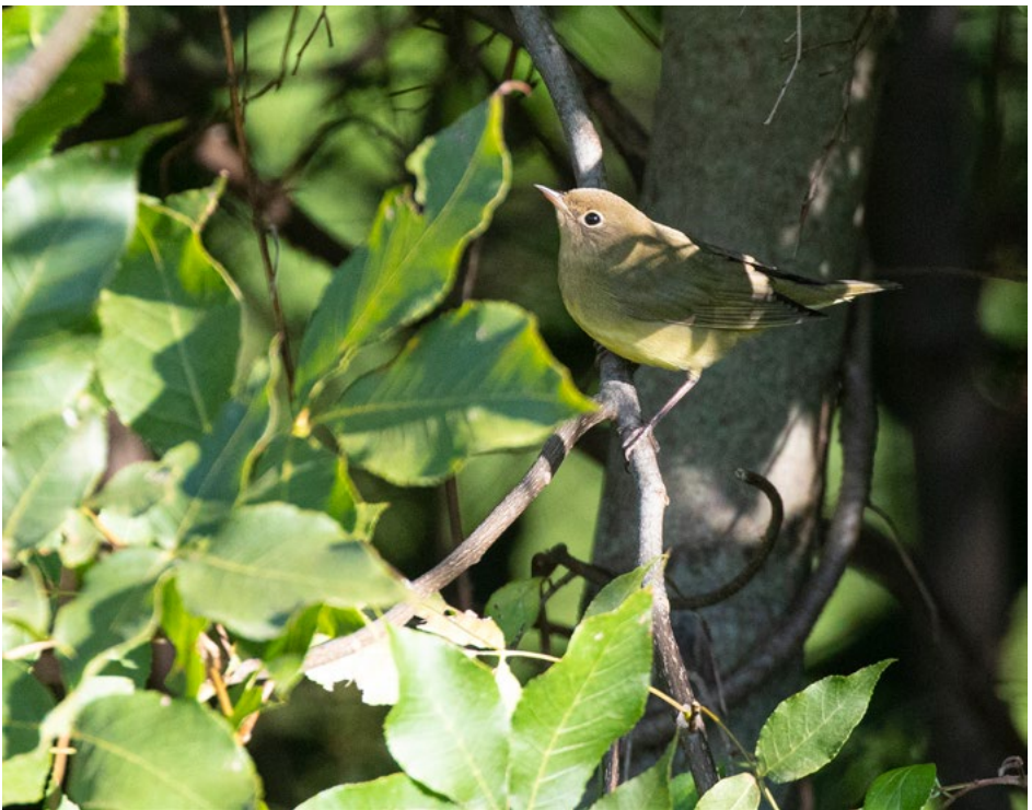
CONNECTICUT WARBLER BY NEIL DOWLING